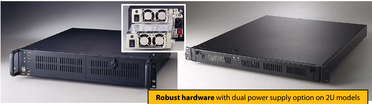
Robust hardware with dual power supply option on 2U models